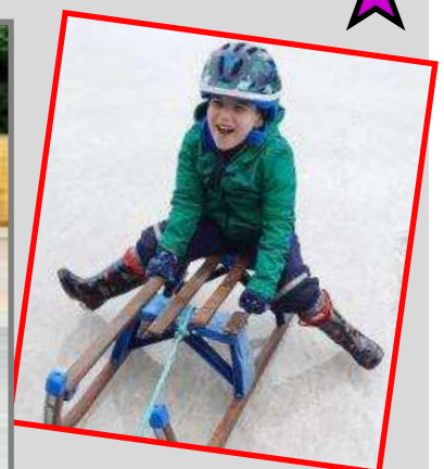
Hudson having a blast!