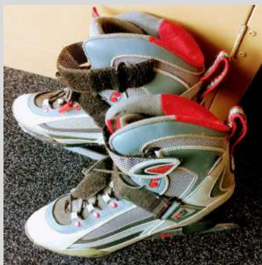
figure skating n.

Blood, sweat, tears, happiness, bliss, determination, grace, elegance, hard work, passion and inspiration in a sport that is more a way of life than a sport.