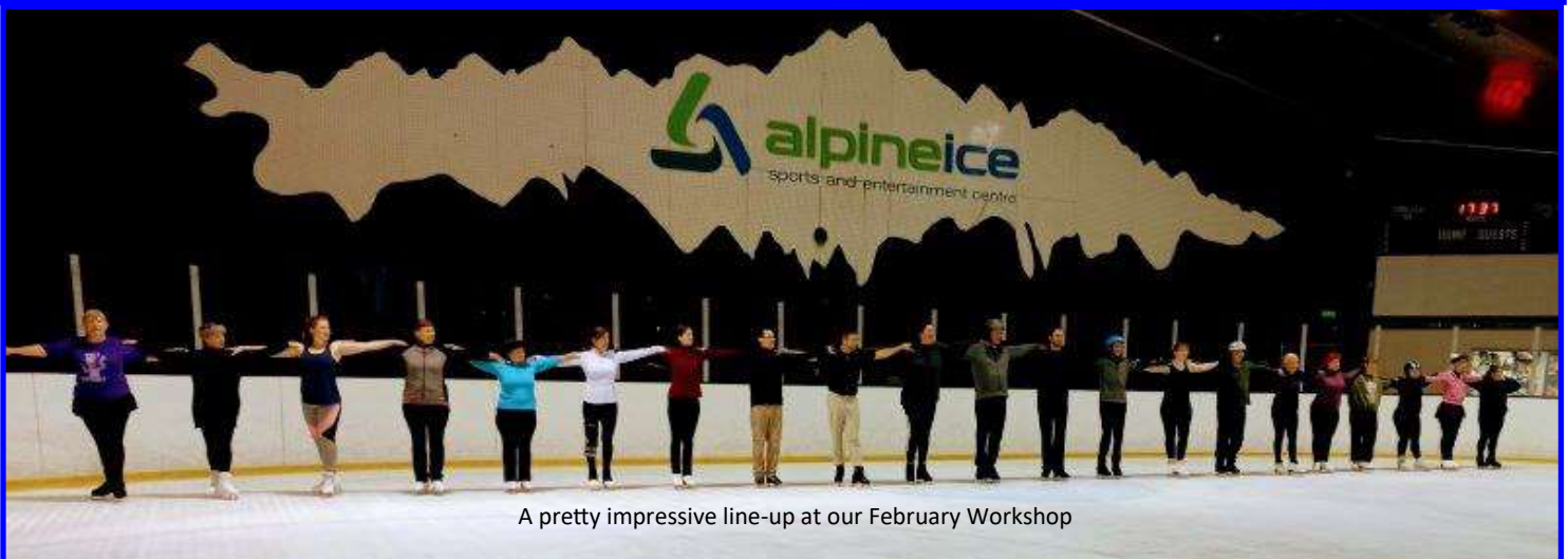
A pretty impressive line-up at our February Workshop