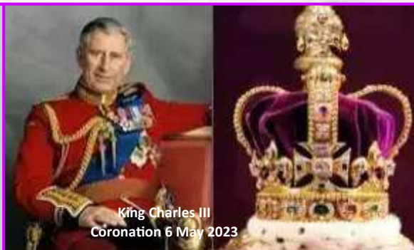
King Charles III Coronation 6 May 2023

King Charles III is a multi-talented man, with prowess in everything from horse riding to fishing - but there's one skill he keeps hidden. Behind closed doors, the 74-year-old monarch is a proficient ice skater – and even has a certificate in the sport. The king reportedly learnt to ice skate at the Richmond Ice Rink, receiving a Certificate of Merit in March 1962 when he was 14. His late mother, Queen Elizabeth II enjoyed skating during childhood too, taking lessons at the Park Lane Ice Club. Following her death, British Ice Skating even released a statement, saying: "For those skaters who have been fortunate enough to have met her over the years, she conveyed warmth, passion and a genuine interest in our wonderful sport."